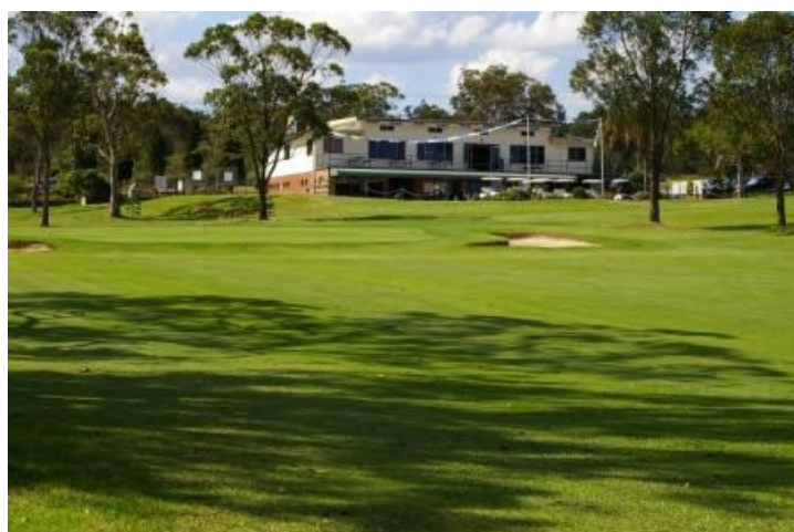
The Old Clubhouse; Prior to Renovations. 1970 - 2009