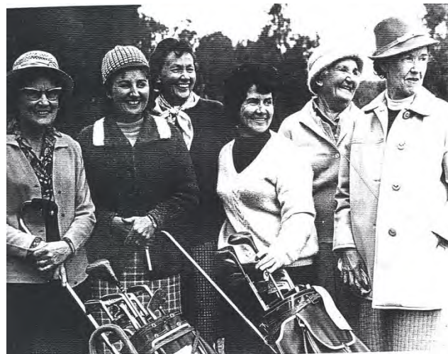
Kilaben Bay Old Course May 1968