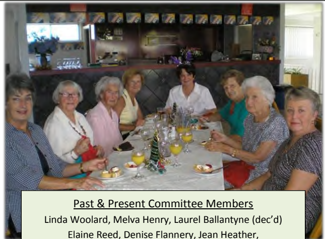
Past & Present Committee Members