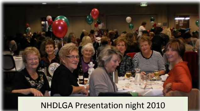
NHDLGA Presentation night 2010