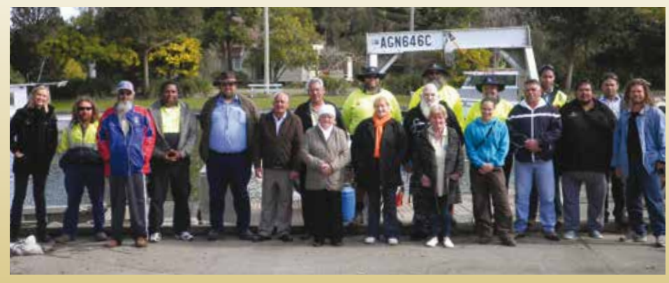
Members of the stakeholder advisory group and individuals that assisted with the repatriation of the artefacts

Aboriginal people have lived on the land for thousands of years, living off the country, and using it as a source of food, water, shelter and providing stability for culture.