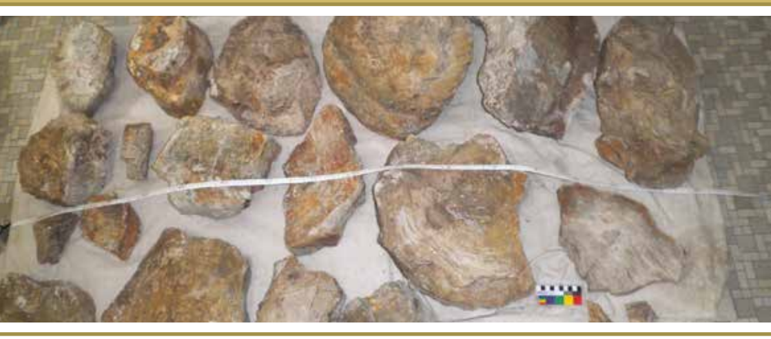
The artefacts being catalogued and recorded for the Aboriginal Heritage Information Management System register