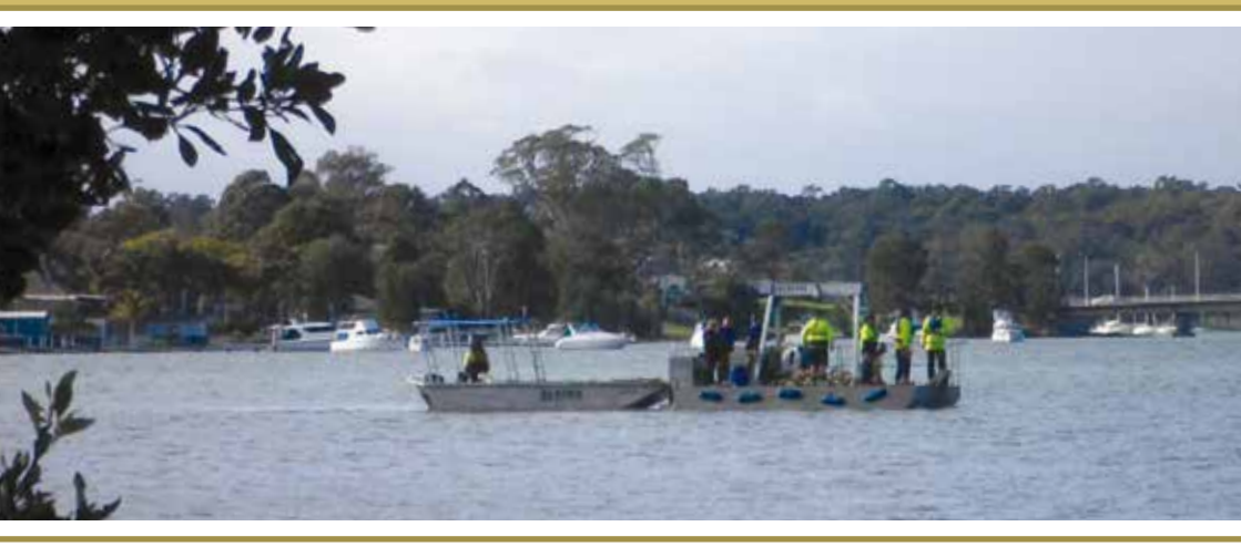
Members of the stakeholder advisory group and Council staff assisting with the return of the artefacts

The trees were Glossopteris, a species allied to the modern Araucaria, which includes the Norfolk Island Pine.