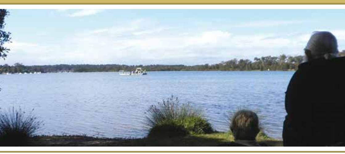
Local Elders watching the return of the Kurra Kurrin from ashore